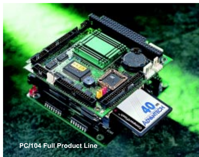
PC/104 Full Product Line