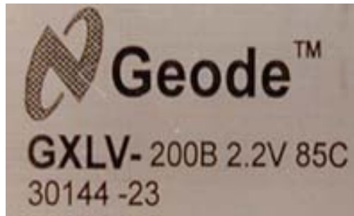
NI's new "Geode™" logo

In the meantime, some new Geode™ logo GXm products might appear side by side with the Cyrix logo GXm products. We hope this explanation will avoid any confusion and help ensure everyone of the chip's quality; standards and specifications of the 2 products are identical. Shown are two pictures with the Cyrix logo and the new Geode logo for your reference.