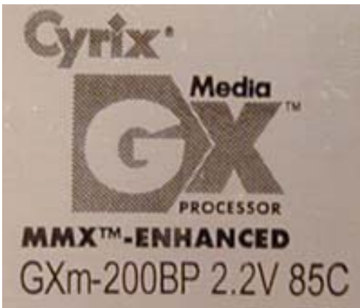
Cyrix's old "GXm™" logo

Advantech would like to announce and explain a new logo appearing on our single board computers. National Semiconductor's Geode™ logo will be standardized on all GXm products from now on. This new logo replaces the current Cyrix marking that currently appears on these products. The Cyrix logo GXm products will continue to be sold until stocks are used up. Eventually, they will all be replaced.