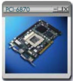
PCI Socket 370 Half-sized SBC with VGA, Ethernet and SSD

Introduction : Put a half size PCI-bus CPU card together with a video capture card, and you get a small yet powerful digital video engine that can power anything from remote surveillance to DV archiving. Or attach network cameras to an existing LAN system to leverage existing infrastructure and lower the total cost of ownership. Unlike traditional CCTV cameras that require special cabling, network cameras connect either directly or wirelessly into exist-ing data networks to make images accessible wherever required.